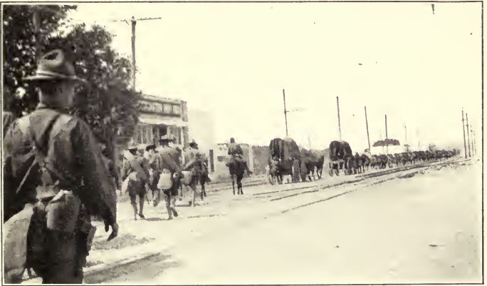
THE BRIGADE MARCH